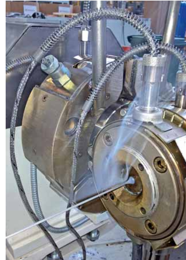
HT A1 high temperature insulation line up to dia. 6 mm

Particular attention has been paid to the very compact line design (up to 20% of space saving