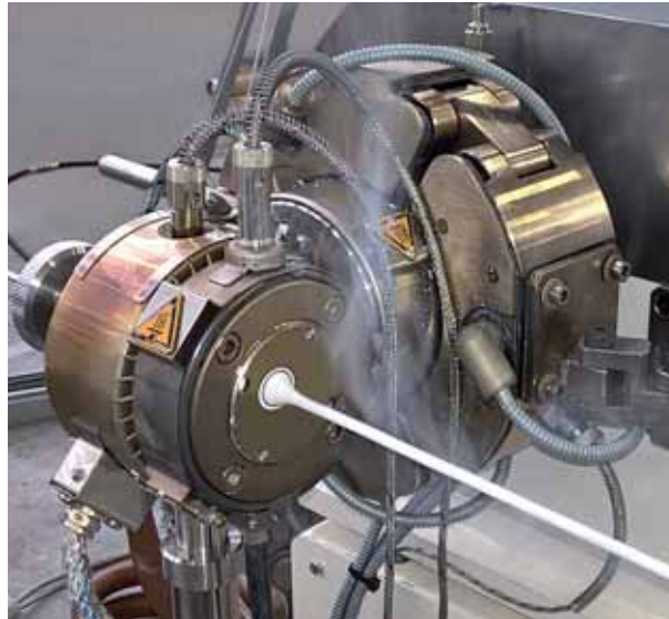
HT B1 high temperature insulation line up to dia. 18 mm

To meet our customers' most demanding requirements, Sampsistemi has recently developed a new family of extruders that allow an improvement of production capacity,