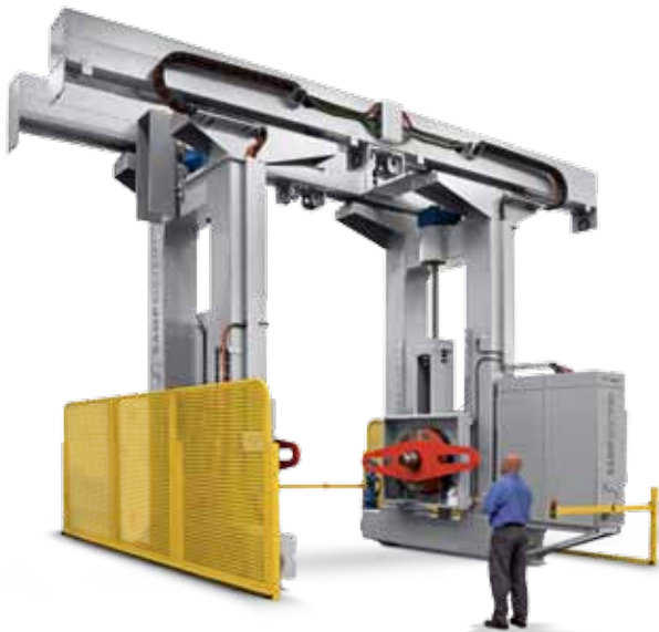
PT 5000 - 70 tons