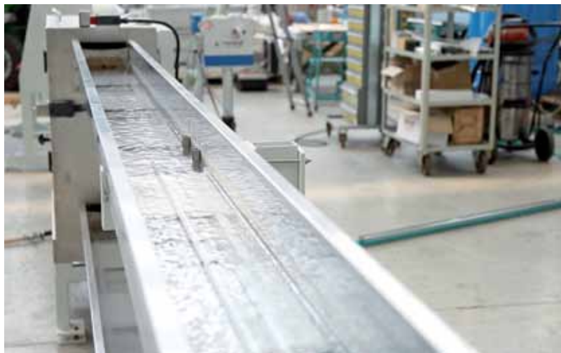
Cooling trough with multipass section

Sampsistemi CIS 115114 Moscow Derbenevskaya str. 1, off.31 Russian Federation Tel.: +7 (499) 23 58 952 cis@sampsistemi.com